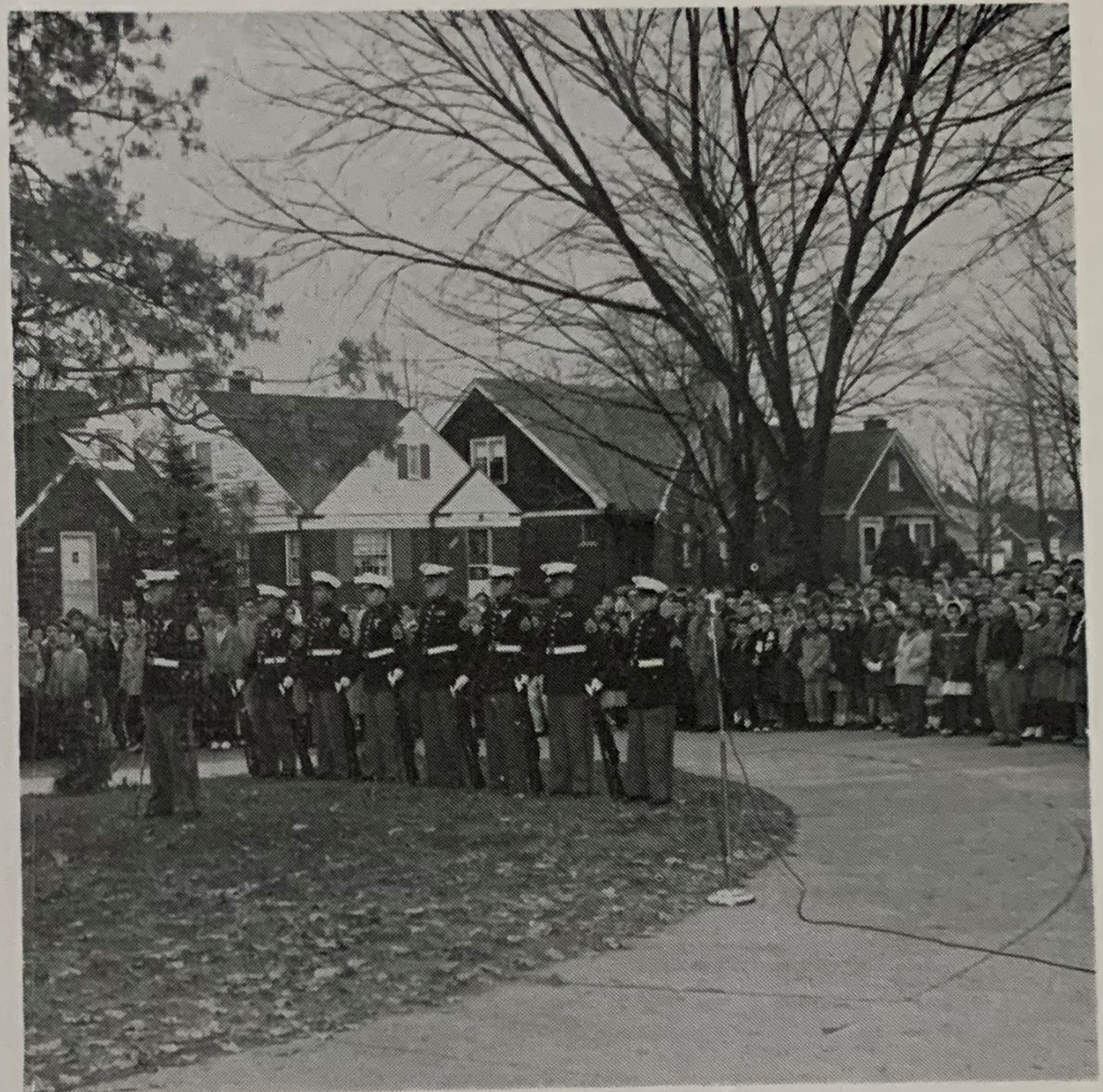
This familiar scene will again take place on Thursday, November 11, 1965 when Lowrey students will gather around the flagpole and observe this dedicated moment.

With this empty area, tables will be put in to the advantage of of Lowrey High School students, studying and homework; a step toward the furthering of education. These tables will be installed for for students.